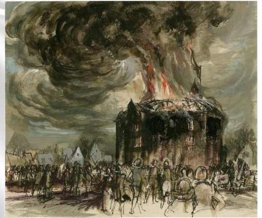
The Globe Theatre burned down on June 29, 1613, and was rebuilt by February 1614.